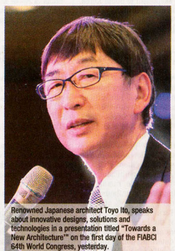
Renowned Japanese architect Toyo Ito, speaks about innovative designs, solutions and technologies in a presentation titled "Towards a New Architecture" on the first day of the FIABCI 64th World Congress, yesterday.